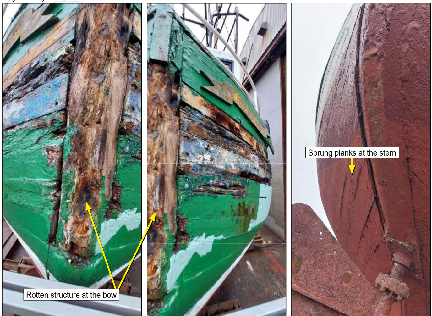
Figure 3: Jean Elaine 's hull defects in April 2024