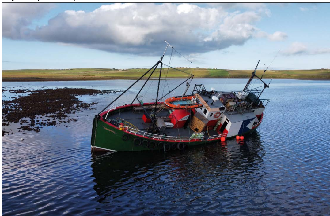
Figure 1: Jean Elaine grounded in Saint Peter’s Pool